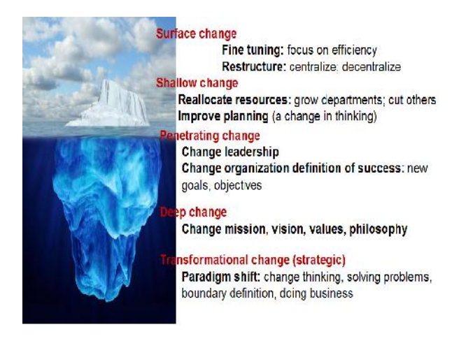
Fig. 2. A taxonomy of change and related measures for implementation Source: Andrzej A. Huczynski, David A. Buchanan (2013) Organizational Behavior , Pearson Education Limited, p.624

On the other hand, for the "ontological flash" to lead to a dramatic rewriting of the organizations', groups' and individuals' covert level it may take war or armed conflict, either as a boundary situation by itself or as a trigger of death and suffering, to occur. For example, in the case of Georgia, a former communist country as well, the transformation of state institutions after the fall of the communist regime followed the same lines as the ones already described. Nevertheless, the Russia-Georgia conflict proved "a catalyst for reform" (Hamilton, 2009), leading to a strong commitment on behalf of Georgian leadership to preserve democracy and truly reform state institutions, the military one included.